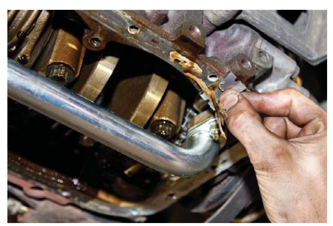
STEP 6 Re-install the dip stick into the block.

Using a razor, clean the oil pan mating surface on the block.