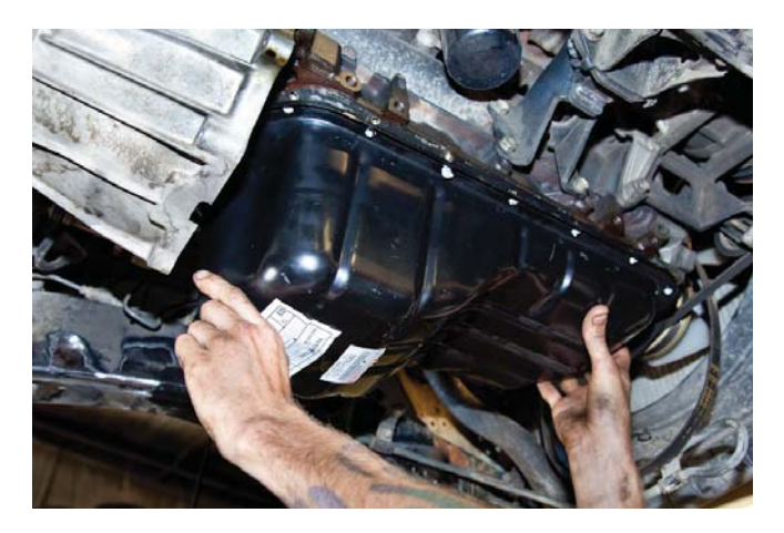
STEP 10 Install the drain plug with gasket.

Install the new oil pan. The strainer now sits towards the back of the truck.