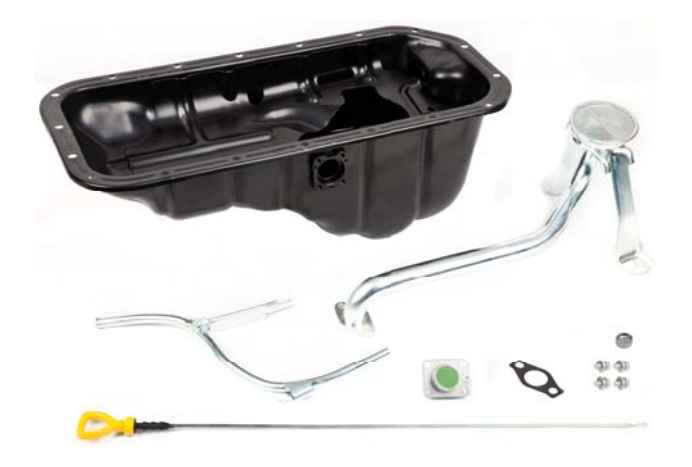
1 ct. 3.4L Tacoma SAS Oil Pan Kit (180156-1-K)

2.7L Tacoma SAS Oil Pan Kit (180155-1-K)