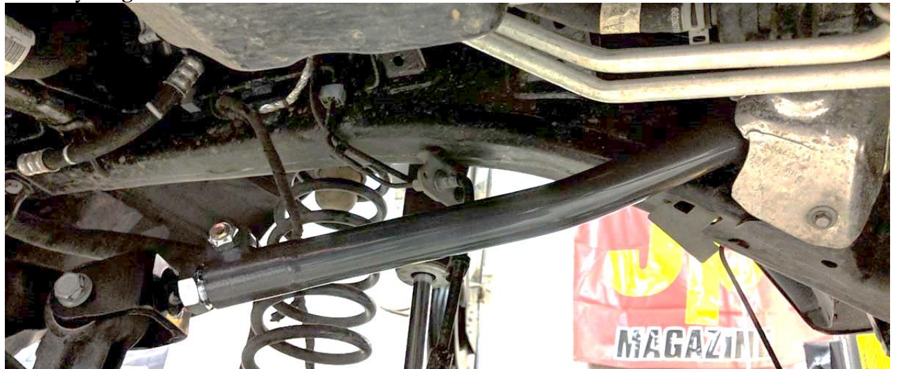
Figure 4. Synergy MFG Right-Side Control Arm Installed With Heat Shield