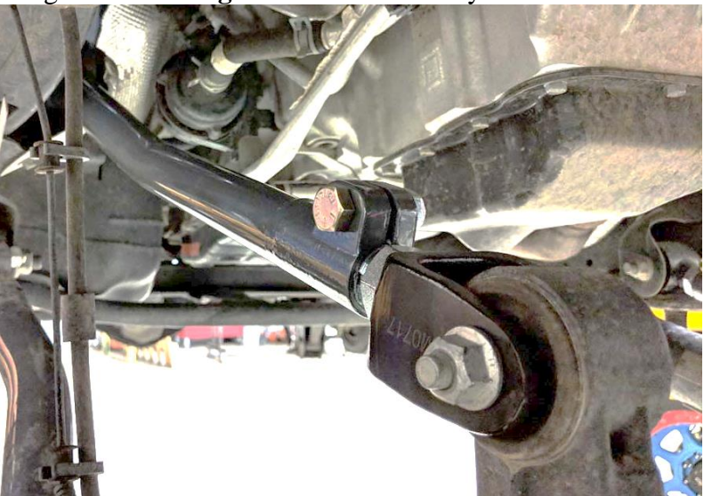
Figure 2. Correctly Installed Synergy MFG Right Front Upper Control Arm

6. Remove the factory left-side upper control arm. Install the Synergy MFG left-side control arm and snug hardware. Figure 3 shows correctly installed control arm.