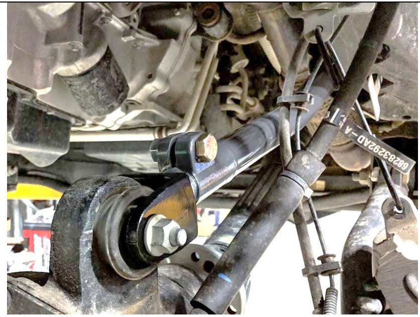
Figure 3. Correctly Installed Synergy MFG Left Front Upper Control Arm