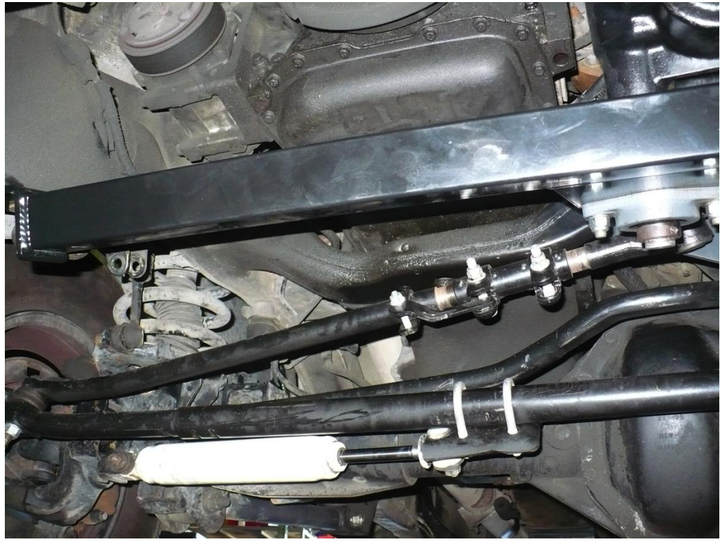
8) Recheck bolts / torques after 100 miles of driving. Grease bearing at normal chassis service intervals.